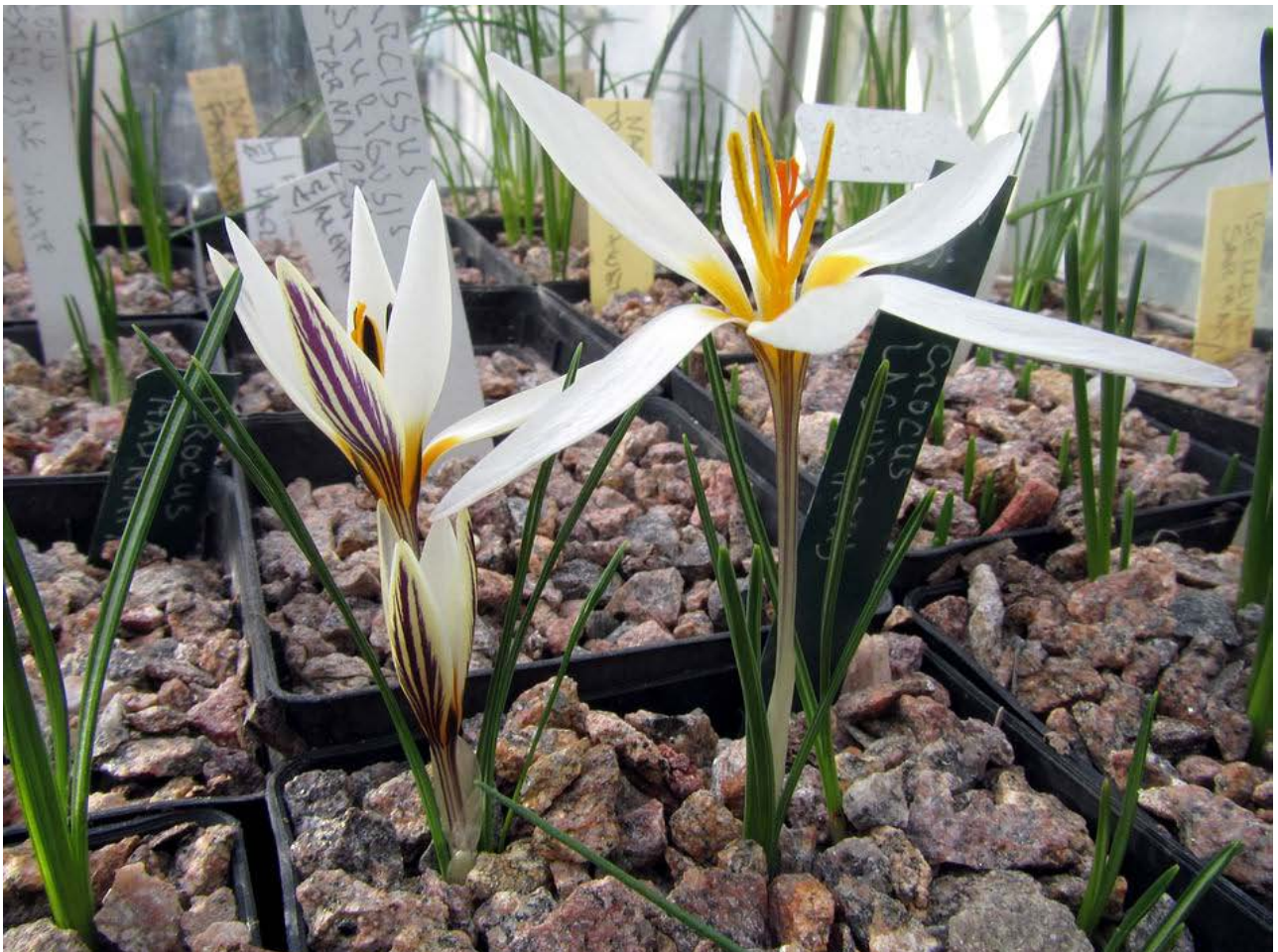
Crocus biflorus nubigena