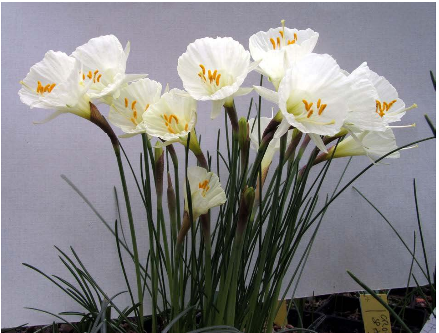
Narcissus romieuxii x Narcissus romieuxii mesatlanticus.

I grow the biggest majority of this group of Narcissus in 7cm pots but that does not mean I do not get lots of flowers, my record stands at 39 flowering stems in a 7cm pot and the one below has 22.