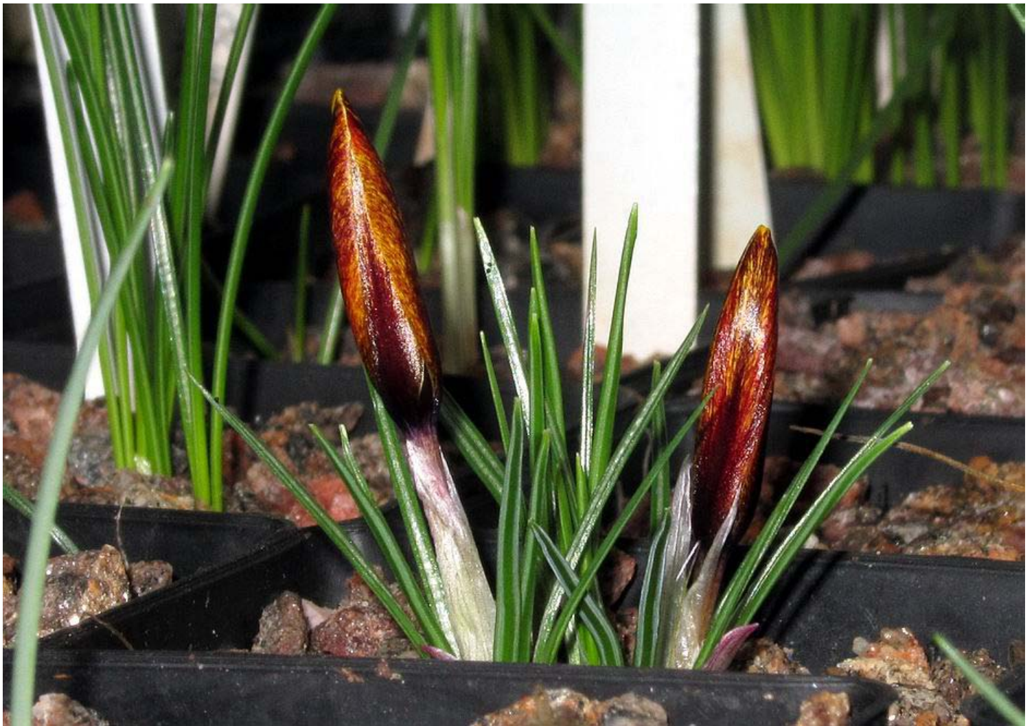
A lovely dark form of Crocus angustifolius is showing its buds – I just hope we get enough warmth for the flowers to open.